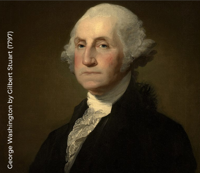
George Washington by Gilbert Stuart (1797)